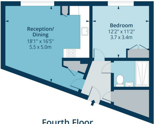
Fourth Floor Floor Area 568 Sq Ft - 52.77 Sq M